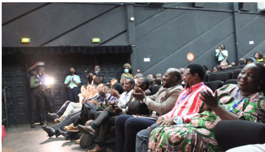
View of the public at the closing ceremony of the forum

In view of what has just been said, it should be noted that many solutions were proposed by the speakers to the problems addressed in the master classes. Let's come to the training workshops where a series of modules were developed with the objective of raising awareness among students in Yaoundé schools, who are not necessarily trained in fact-checking, and to share with them knowledge on fact-checking tools and techniques.