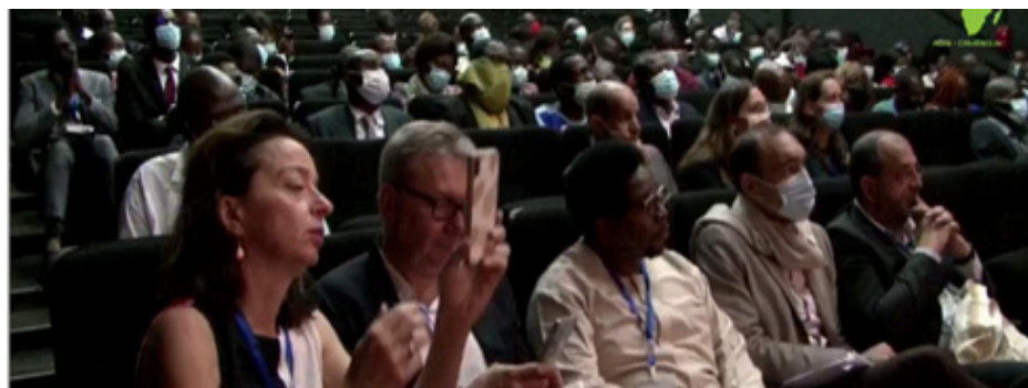
View of the public

However, the experts noted that the fight against misinformation regarding Covid-19 and other pandemics such as cholera and HIV/AIDS, among others, remains a perpetual struggle that must be carried out at all levels and involve various actors, notably health care workers, the media, citizens (through the responsible use of information and communication networks and platforms; Information and Communication Technologies (ICT) in a global way), public authorities/government (they must constantly review the strategies implemented to fight against, encourage those that work and improve those that do not work or at least outlaw them).