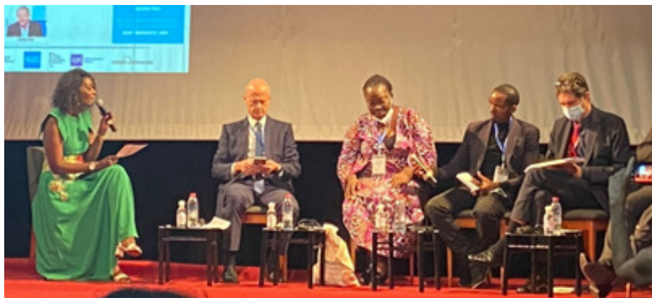
Inaugural round table