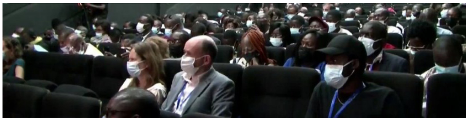
View of the public at the opening ceremony of the forum

The preceding paragraphs summarise the reflections that took place during the round tables on the central theme of “Access to information and freedom of expression in the face of disinformation” . In the following paragraphs, the specific issues of fact-checking journalism that were addressed in the master classes are not dealt with.